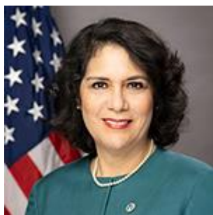
The Honorable Maria-Elena Giner, Ph.D.

United States Commissioner, International Boundary and Water Commission, United States and Mexico