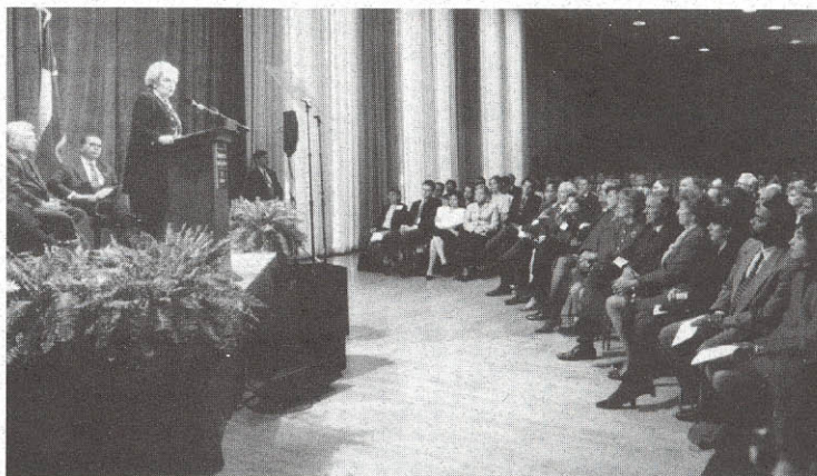
Secretary Albright's audience included students, faculty, community leaders, members of the consular corps, and concerned citizens.