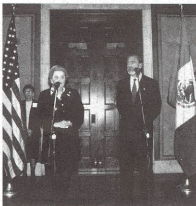
Secretary Albright and Mexican foreign minister Gurría hold a joint press conference at the conclusion of their private meeting on the Rice campus.

Albright's address at Rice was only the centerpiece of a whirlwind trip to Houston. Earlier in the day, she spoke to students at Lamar High School. Just prior to her speech, Albright met privately on the Rice campus with Mexican foreign minister José Angel Gurría. She also met with a group of leading corporate executives at an event sponsored by the New York-based Business Council for International Understanding. In a private meeting, Albright conferred with former president George Bush, a longtime Houston resident.