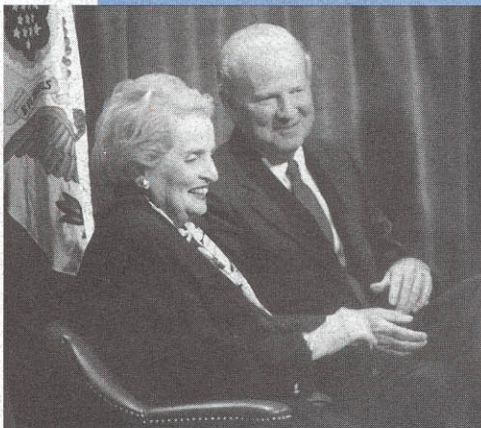
Secretary Albright and James A. Baker, III, share a light moment before she addresses the audience.