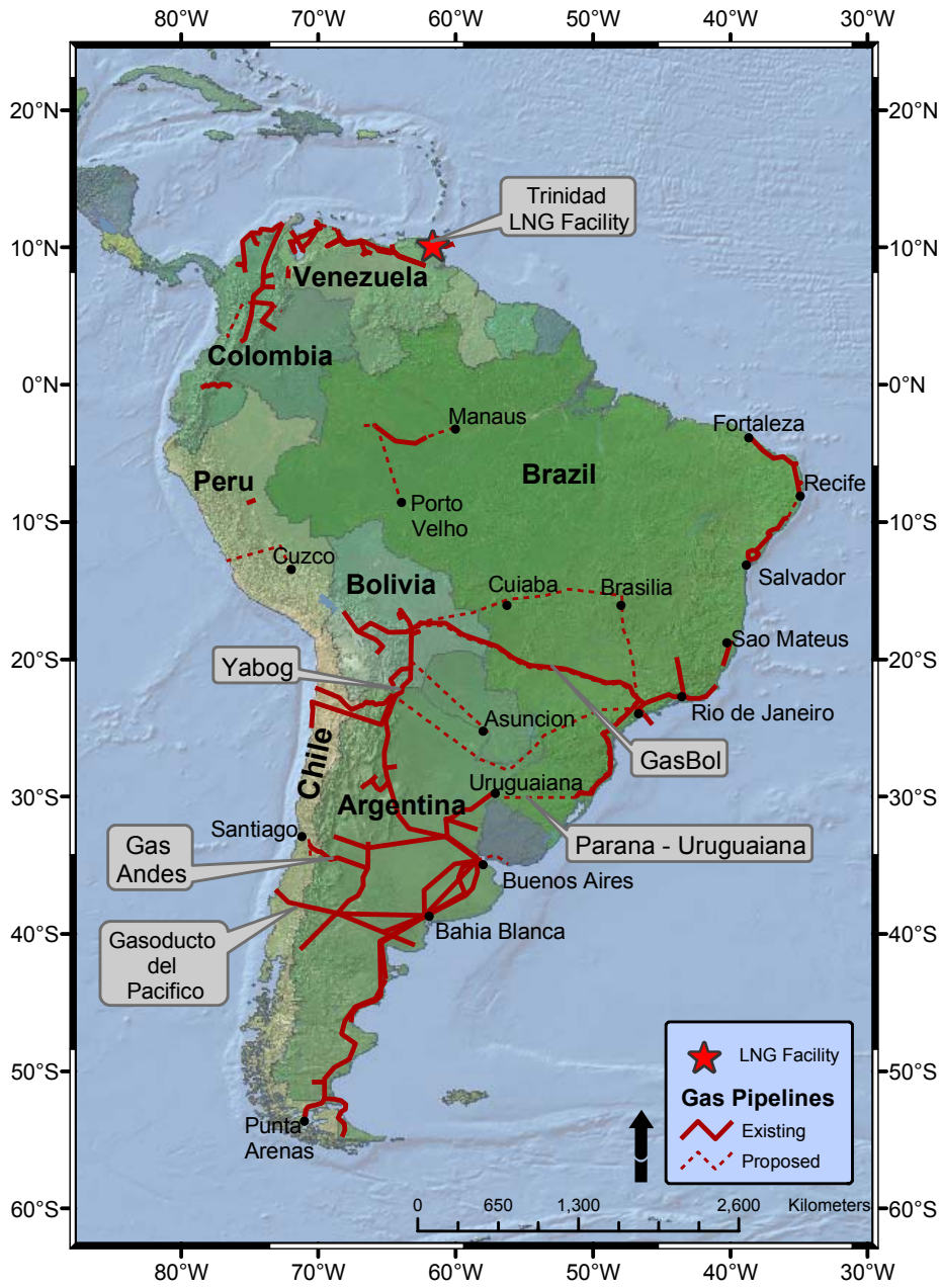
Figure 1. Gas Pipelines in the Southern Cone