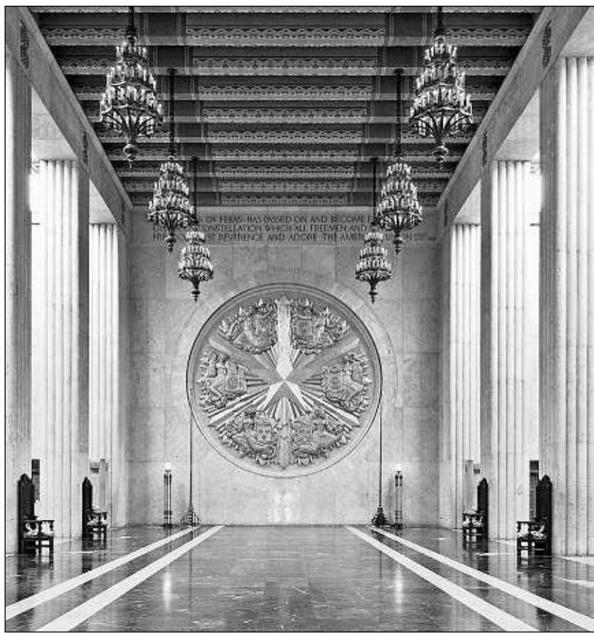
RICH IN HISTORY: The high ceiling and soaring columns of the Hall of State in Dallas' Fair Park drew comparisons to Westminster Abbey on opening day in 1936.