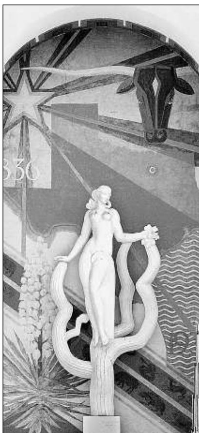
STATE SPIRIT: The Spirit of the Centennial statue stands in front of a mural on the Women's Museum at Fair Park in Dallas.