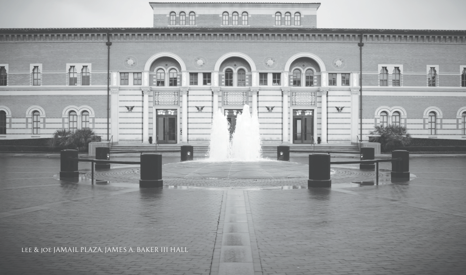
LEE & JOE JAMAIL PLAZA, JAMES A. BAKER III HALL