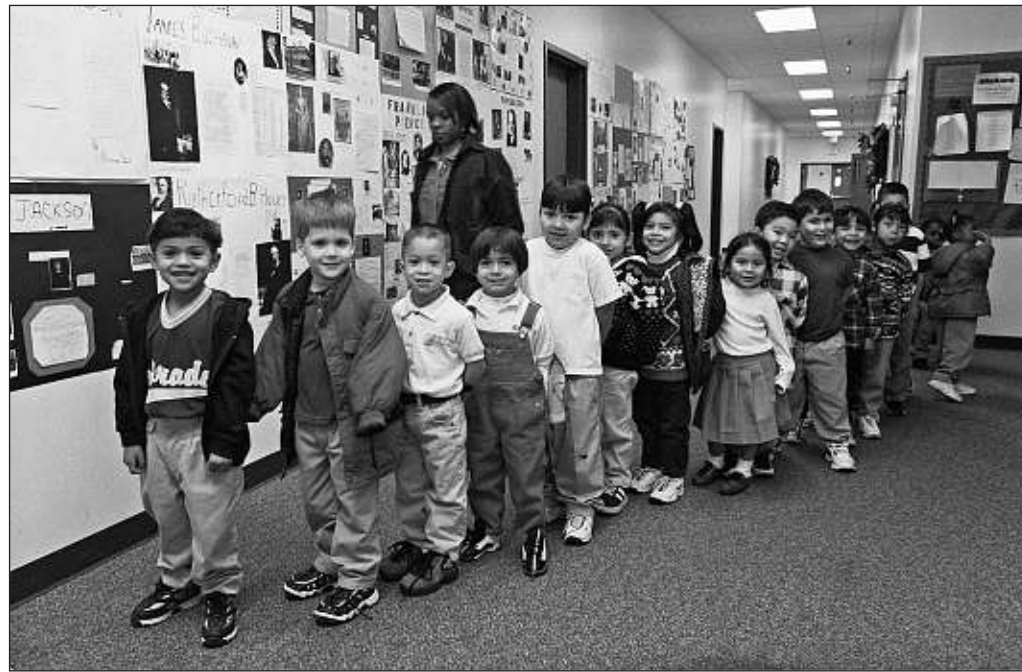
ENERGIZED: Children line up for lunch at Energized for Excellence Academy, an HISD charter school.