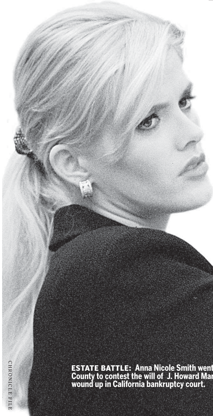
ESTATE BATTLE: Anna Nicole Smith went to court in Harris County to contest the will of J. Howard Marshall. The case wound up in California bankruptcy court.

justice are undercut by a leap to California bankruptcy court. Why is this happening? And what does it portend for our legal system?