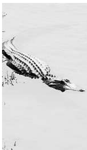
D. Fahleson / Chronicle