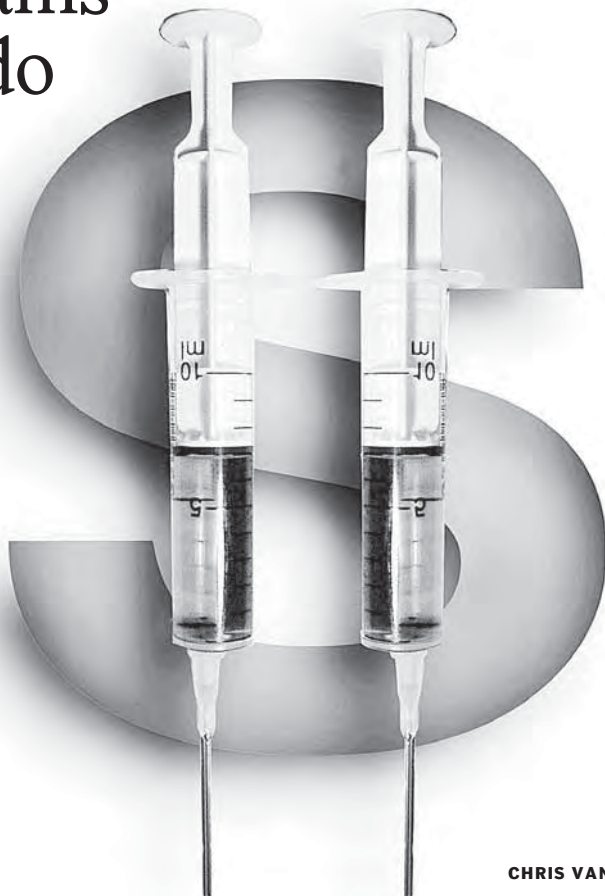
CHRIS VAN ES

Though some sincerely question the scientific evidence, please see NEEDLES , Page B11